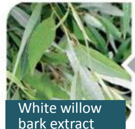
White willow bark extract