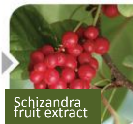
Schizandra fruit extract