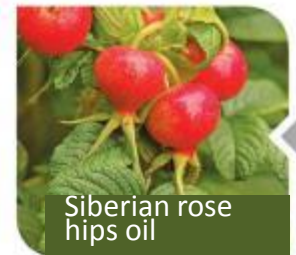
Siberian rose hips oil