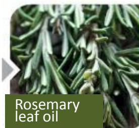
Rosemary leaf oil