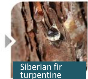
Siberian fir turpentine