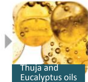
Thuja and Eucalyptus oils