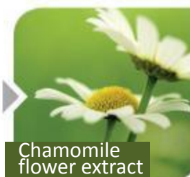
Chamomile flower extract