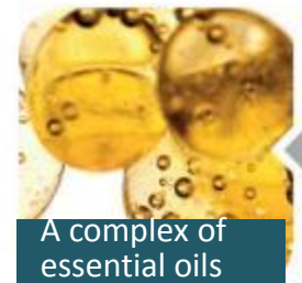
A complex of essential oils