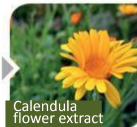
Calendula flower extract