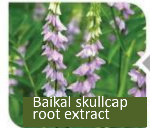
Baikal skullcap root extract