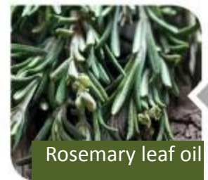
Rosemary leaf oil