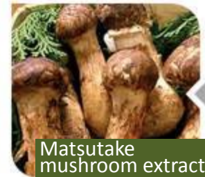
Matsutake mushroom extract